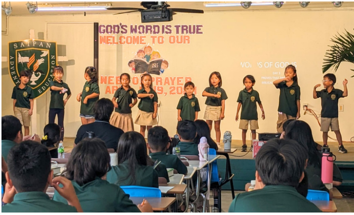
The kindergarten students were singing "Full Armor of God" during chapel on Wednesday.