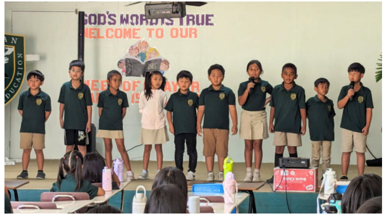
On Thursday, students from the 1st and 2nd grade rendered a special number called "Peace in Christ"