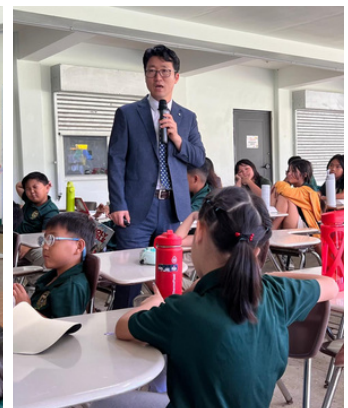
This week was our Spring Spiritual Emphasis. Every day covered a different topic that explains the authenticity of the Bible. The five-day lineup is as follows: Scripture is validated by philosophy, science, archeological finds, prophecy, and textual criticism.