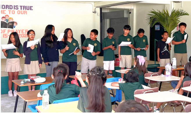
5th and 6th singing "We are the World" to close off our amazing spiritual emphasis week.