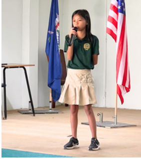
A 3rd grader singing "Great Are You Lord" during chapel last Monday!