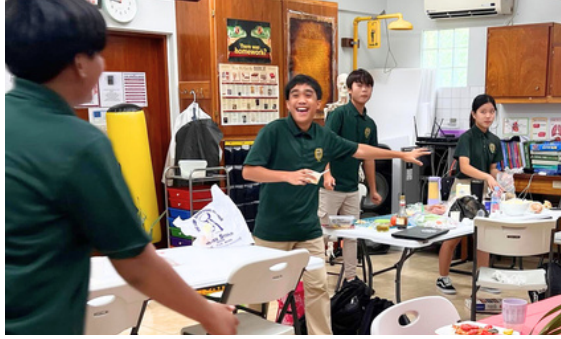
The 7th and 8th graders had a classroom Food Contest in health class to help understand a balanced diet. Each group prepared a complete meal which included all the food groups and also had to make sure it was nutritious, colorful, and tasty.