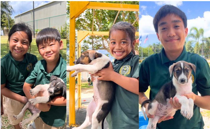
Our elementary students had a great time playing with these cute puppies. What a fun brain break!