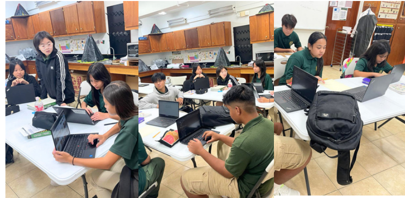
The 7th and 8th Grade students are brainstorming on putting up a Healthy Lunch Menu for their Health Nutrition on Friday, April 19, 2024.