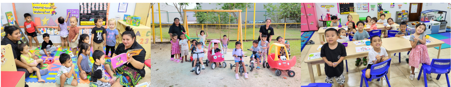
Here are some class pictures of the CDC Students doing different kinds of activities. From left to right: the Toddlers during story time; the Preschool class during outside play at the playground; and the Pre-Kindergarten class are painting their story of the week, "Ruth and Naomi".