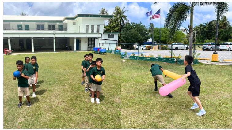
1st and 2nd Grade students playing ball passing relay and noodle tag during their Physical Education class.