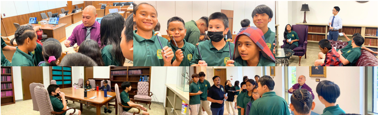
The 5th and 6th Grade students had a field trip at the District Court to learn more about the judiciary and interact with the Judges and Marshalls.