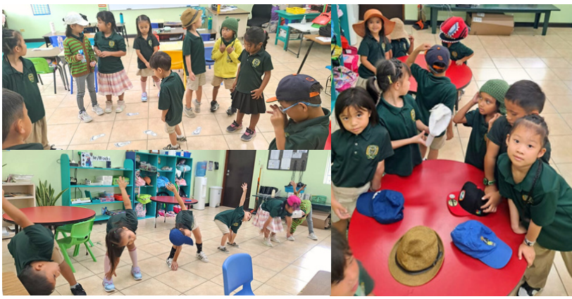
Kindergarten students doing different kinds of activities: footprint Bible verse activity, stretching before going to P.E., and sorting activity using their favorite hats.